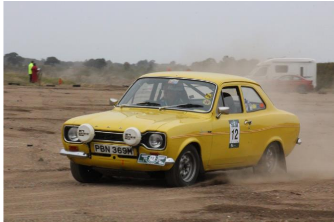
Test at Bill Gwynne Rally School : photo © Motoring Waffle

Regularity 3 'The Buckinghamshire railway' had us back on tulips but with a cumulative speed table and numerous speed changes. Whilst no pre-plotting was required, a look at the maps the previous night did help us to find the tiny turning which led on to a long white and two controls, our best reg result only dropping one second at each control.