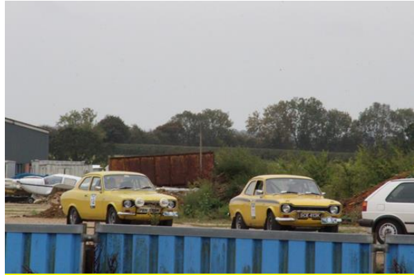
Yellow Escorts seem to be breeding - car 104 at our accomodation and Tim Sawyer's New one running car 11