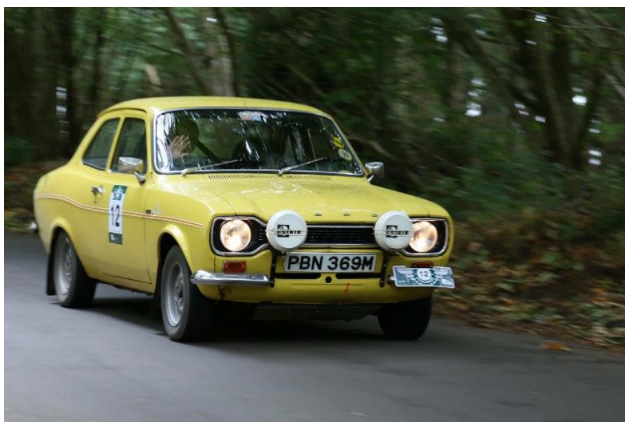
Everton Stubs

The last two rounds of the HRCR Clubmans Road Rallying Championship have fallen badly for us. Clive has to work for the rescheduled Tour of Cheshire date on 29th September whilst the Devils Own Rally on 20 October is too close for comfort to our final event of the year, the Rally of the Tests, as we don't want to risk damaging the car.